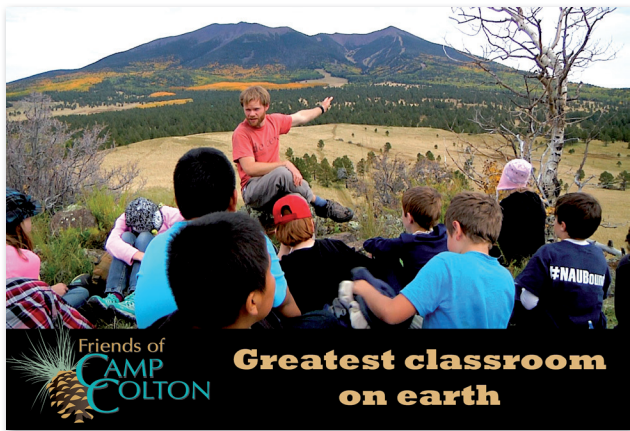
Friends of Camp Colton (FCC)