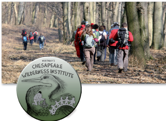
Chesapeake Wilderness Institute (CWI)