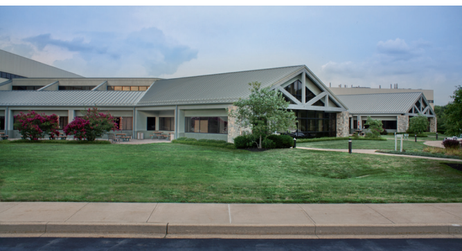
Manufacturing site Elkton

For the crystal water project, low energy humidification systems have been installed in the production areas, offering several efficiency and operational improvements. The new dry fog humidifier systems lead to a significant energy saving compared to the old ones as well as to a CO 2 emission reduction of 870 tons per year. They also allow more humidifying capacity for precise humidity control to meet production and process requirements. Due to reduced dust and associated static issues, the changes also improved the working conditions for Gore associates.